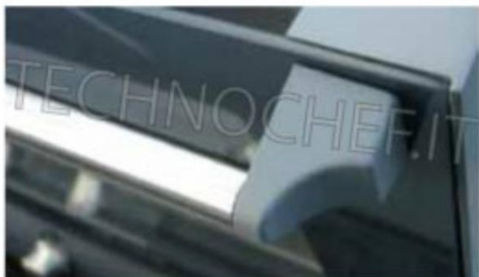
Colonnine porta in tecnopolimeri