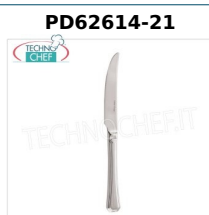
STEAK KNIFE HOLLOW HANDLE, ARCADIA line