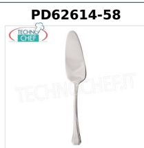
CAKE SHOVEL, ARCADIA Line