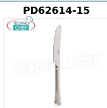
TABLE KNIFE CABLE HANDLE, ARCADIA Line