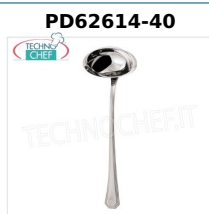
LADLE, ARCADIA Line