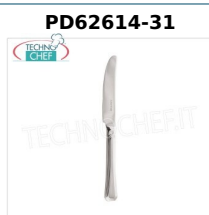
DESSERT KNIFE HOLLOW HANDLE, ARCADIA Line