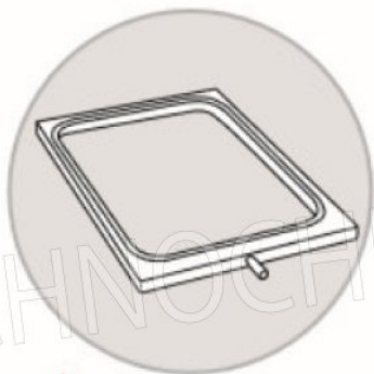
STAMPO MV mm 195X260 MOULD MV mm 195X260