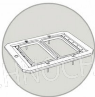
STAMPO GN 1/4 mm 265x160 MOULD GN 1/4 mm 265x160