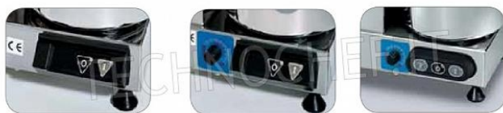
Mod. SI-C4 SI-C6