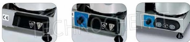
Mod. SI-C4 SI-C6