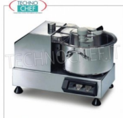
TABLE CUTTER in STAINLESS STEEL, bowl capacity 3.3 lt, speed 2,800 rpm, V.230/1, Kw.0.35, Weight 11 Kg, dim.mm.365x305x255h