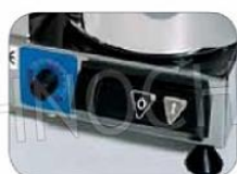
Mod. SI-C4VV SI-C6VV SI-C9VV