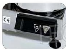
Mod. SI-C4 SI-C6