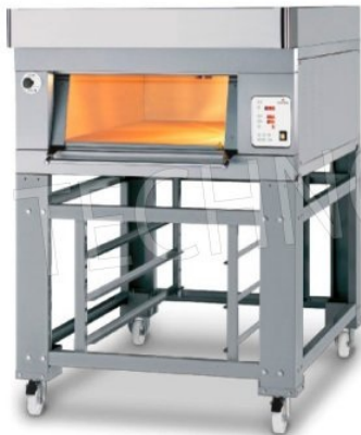
PASTFOOD - H27

Forno elettrico modulare con camera di cottura in lamiera di acciaio alluminata di altezze diverse. Piano di cottura in refrattario o in lamiera bugnata. Elementi riscaldanti elettrici ad altissime prestazioni.