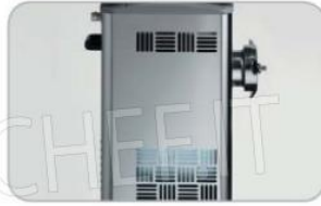
Griglie di ventilazione TC ICE TC ICE airing take