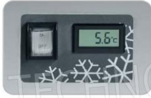
Comandi TC ICE TC ICE controls