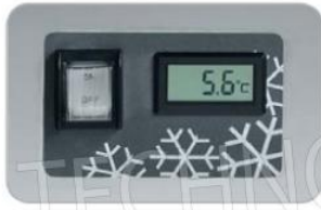
Comandi TC ICE TC ICE controls