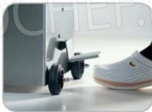
Ritorno pistone automatico