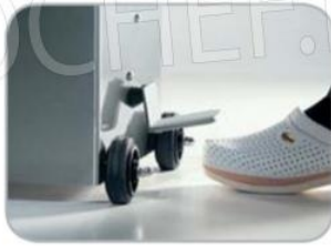
Ritorno pistone automatico