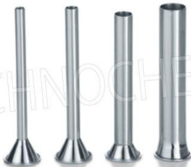
Imbuti inox (ø 13-16-20-25-28-38) opzionali