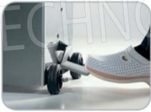
Azionamento spinta pistone