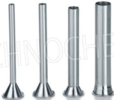
Imbuti inox (ø 13-16-20-25-28-38) opzionali