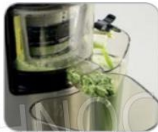
Vaschetta per gli scarti Tray for waste