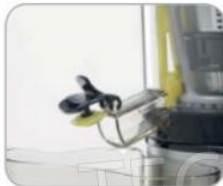
Tappo salvagoccia Drip cap