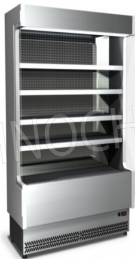
Versione in acciaio inox