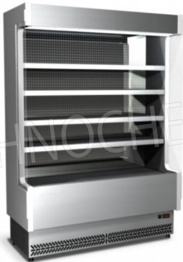
Versione in acciaio inox