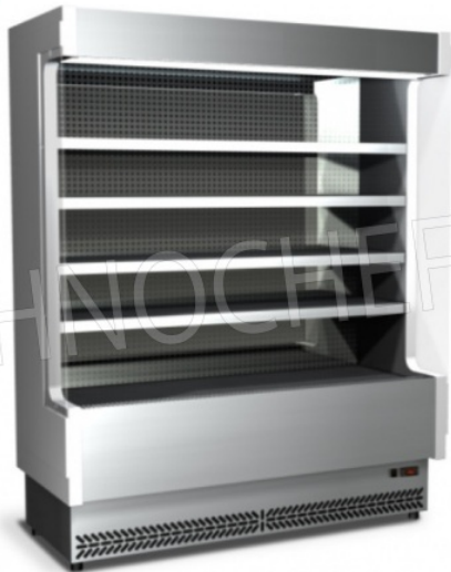
Versione in acciaio inox