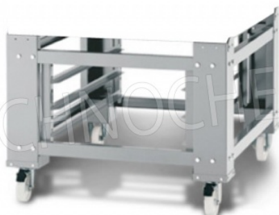
SUPPORTO IN ACCIAIO VERNICIATO