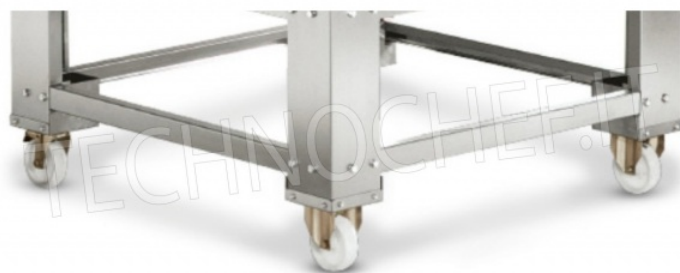
KIT 4 RUOTE (2 CON FRENO)