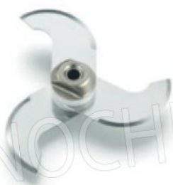
Mozzo a 3 lame Hub with 3 blades