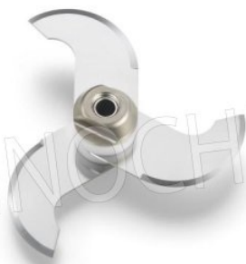
Mozzo a 3 lame