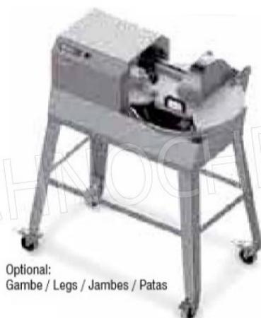
Optional: Gambe / Legs / Jambes / Patas