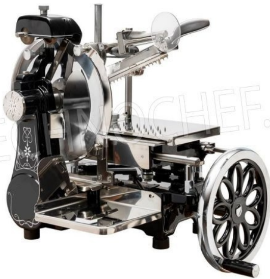
Optional Decoro liberty