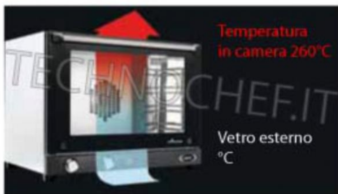
Doppio vetro con sistema Protek Safe