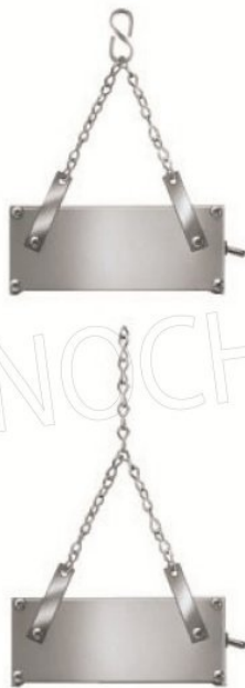
Catenella per sospensione