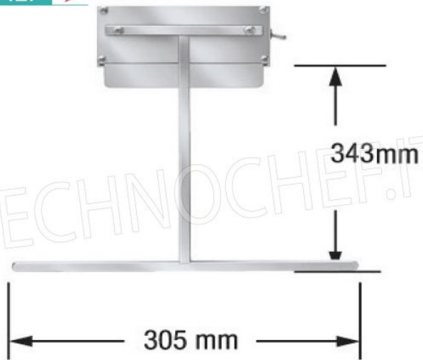
Supporto a T