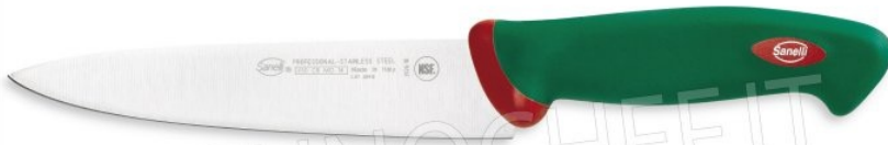
COLTELLO CUCINA CM.18 PREMANA