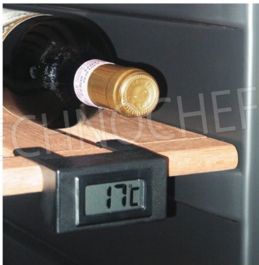
ACCESSORIO: Termometro digitale per ripiani in legno