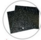
Set tavole di riempimento in polietilene Polyethylene filling squares set