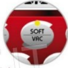
Soft vacuum elettronico Electronic soft vacuum