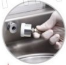
Connessione per attacco gastrovac Connection for the gastrovac system