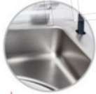
Vasca inox con angoli stondati senza saldature Entirely printed stainless steel vacuum chamber, with internal round corners