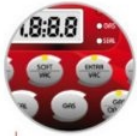
Pannello multifunzione digit - 10 PRG Multifunction digit panel - 10 PRG