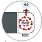
Sistema autopulizia olio Oil made auto cleaning system