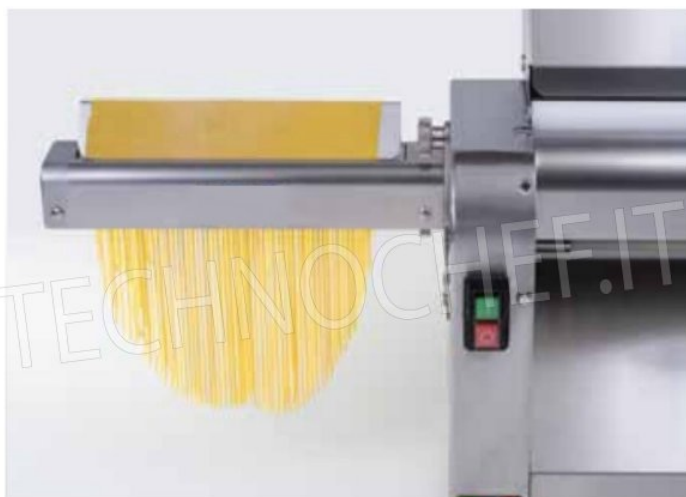
Tagliolino con passo regolare