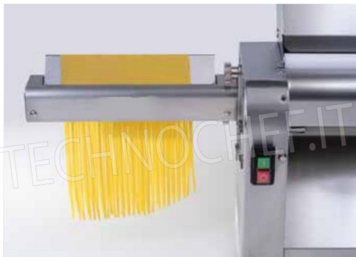
Trenette con taglio a passo irregolare come se fossero tagliate a mano