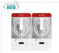
Table-top ice cream/slush maker, with LED FRONT LIGHT, 2 TUBES, 5.6 L, Weight 38 Kg, dim. 370x440x490h mm