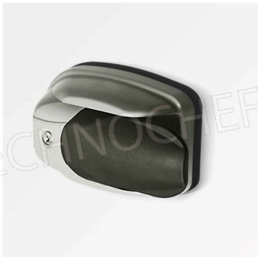
MANIGLIA STANDARD CON SERRATURA, CHIAVE A SBLOCCO INTERNO DI SICUREZZA