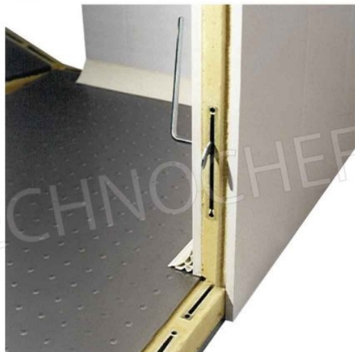
PAVIMENTO + PANNELLO: MONTAGGIO SEMPLICE E VELOCE TRAMITE FISSAGGIO CON AGGANCIO ECCENTRICO.