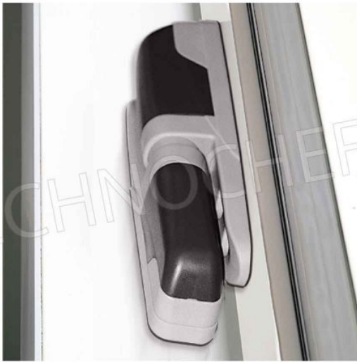
CERNIERE FACILMENTE REGOLABILI IN UTENZA IN 3 DIREZIONI