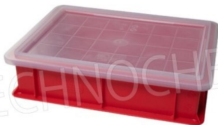
VAS403010 ROSSO TRAFFICO + COPERCHIO TRASPARENTE COP4030T