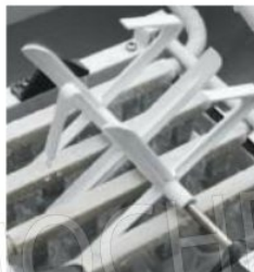
Manutenzione facilitata Easy maintenance Entretien facile Fácil mantenimiento