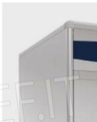
Carrozzeria in acciaio inox Stainless steel body Carrosserie en acier inox Carroseria en acero inoxidable