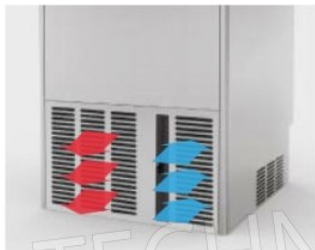
Aerazione frontale, ideale per l'incasso Frontal air circulation, suitable for reduced spaces Ventilation frontale, idéale pour espaces réduits Ventilación frontal, ideal para espacios reducidos