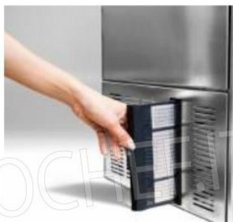
Filtro frontale di condensazione facilmente estraibile Easily removable front condensation filter Filtre frontal à poussière, facile à enlever Filtro antipolvo frontal, fácilmente extraíble