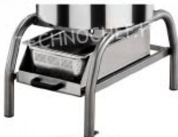
CAVALLETTO + cassetto con filtro FMCCF