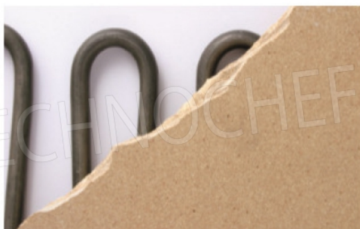
Particolare del piano di cottura in materiale refrattario e delle resistenze corazzate.