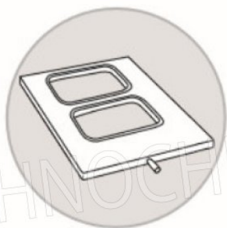
STAMPO MV mm 138x96 MOULD MV mm 138x96