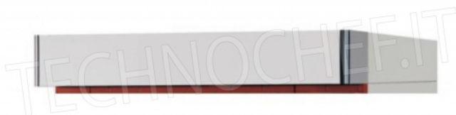
MODELLO CAPPA CON FRONTALE INOX