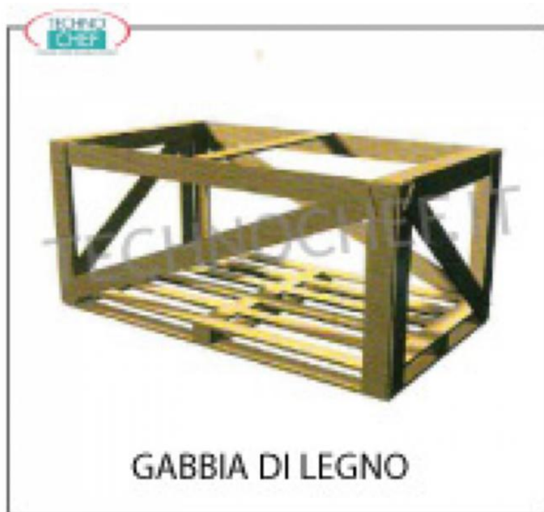
GABBIA DI LEGNO