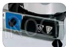
Mod. SI-C4VV SI-C6VV SI-C9VV