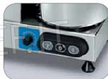
Mod. SI-C4VT SI-C6VT