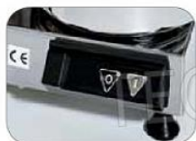
Mod. SI-C4 SI-C6