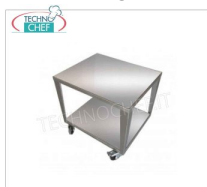
Machine Support Trolley, Mod. CR Support trolley