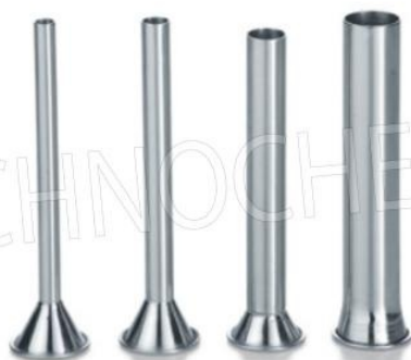
Imbuti inox (ø 13-16-20-25-28-38) opzionali