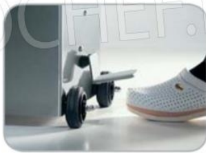
Ritorno pistone automatico