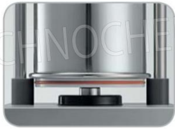
Guarnizione ermetica su cilindro oleodinamico