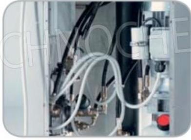
Particolare centralina e comandi