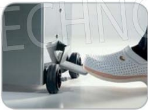
Azionamento spinta pistone