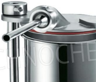
Ghiera inox opzionale