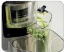
Vaschetta per gli scarti Tray for waste