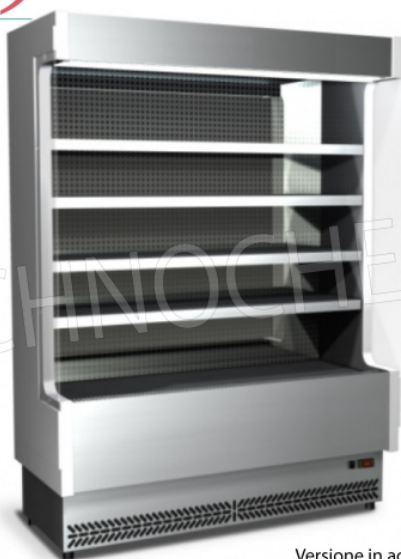
Versione in acciaio inox