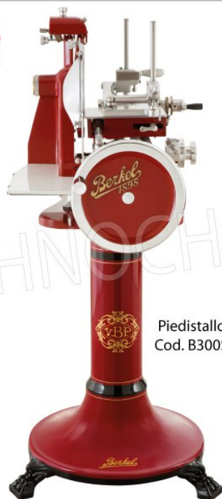
Piedistallo Cod. B300STAND (Optional)