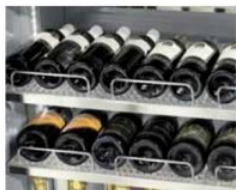
I ripiani in polycarbonato e acciaio inox sono posizionabili a diverse altezze e reclinabili, è sufficiente spostare le viti con cui sono fissate alla barra centrale.