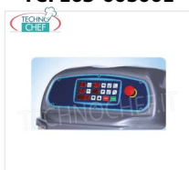
DIGITAL CONTROL PANEL Digital control panel