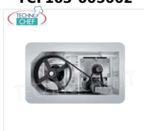
SPIRAL TRANSMISSION with TRANSMISSION Spiral transmission with return (no for code TCF163-003400).