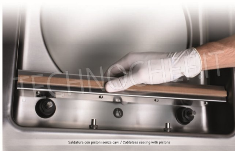
Saldatura con pistoni senza cavi / Cableless sealing with pistons