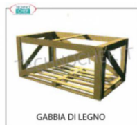
GABBIA DI LEGNO

Wooden cage, dimensions mm 3100x1000x1100h, for mod. SALINA 80 length 2960 mm, net price for platform + perimeter cage