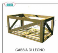
GABBIA DI LEGNO

Wooden cage, dimensions mm 2600x1000x1100h, for mod. SALINA 80 length 2480 mm, net price for platform + perimeter cage