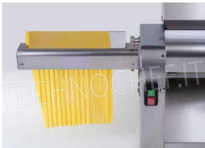
Tagliatelle (fettuccine) con taglio a passo irregolare come se fossero tagliate a mano