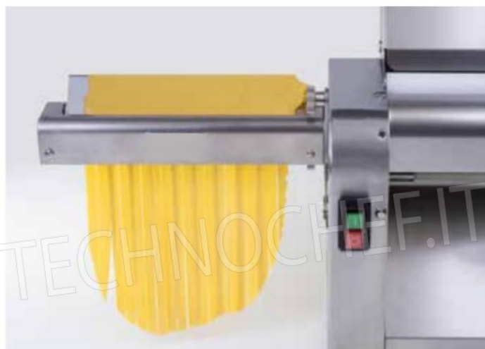
Pappardelle (lasagnette) con taglio a passo irregolare come se fossero tagliate a mano